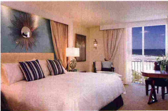
Guestroom mock-up at the Gallery in Atlantic Beach, Florida.

The first Gallery will open this year in Atlantic Beach, Florida.